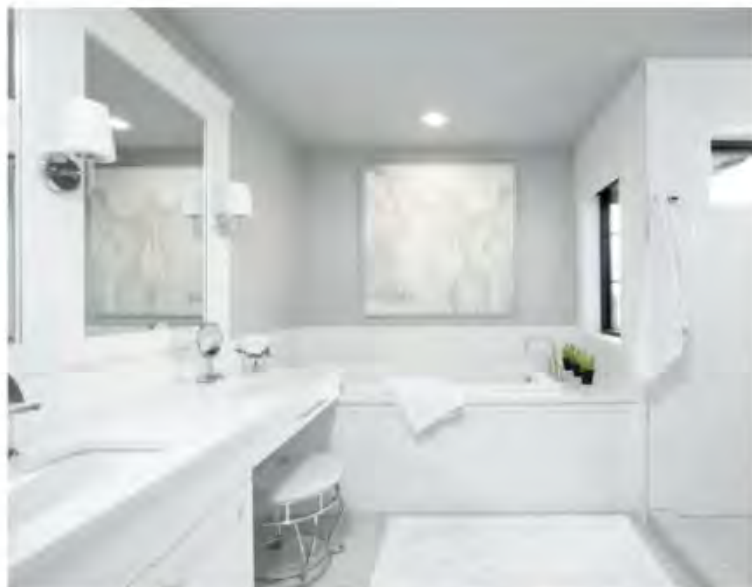
↑ Serene in white, the master bath showcases a glass shower, silver floor tiles and chrome finishes.