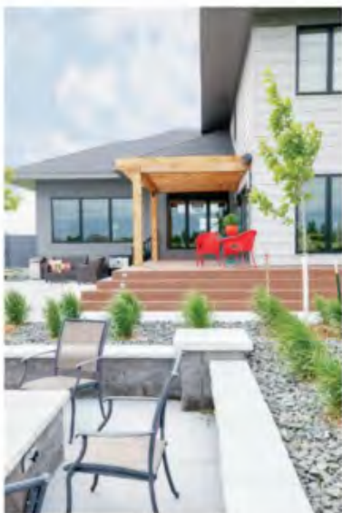
↑ The tranquility of the outdoor living space was a major component of the homeowner's design wishes.