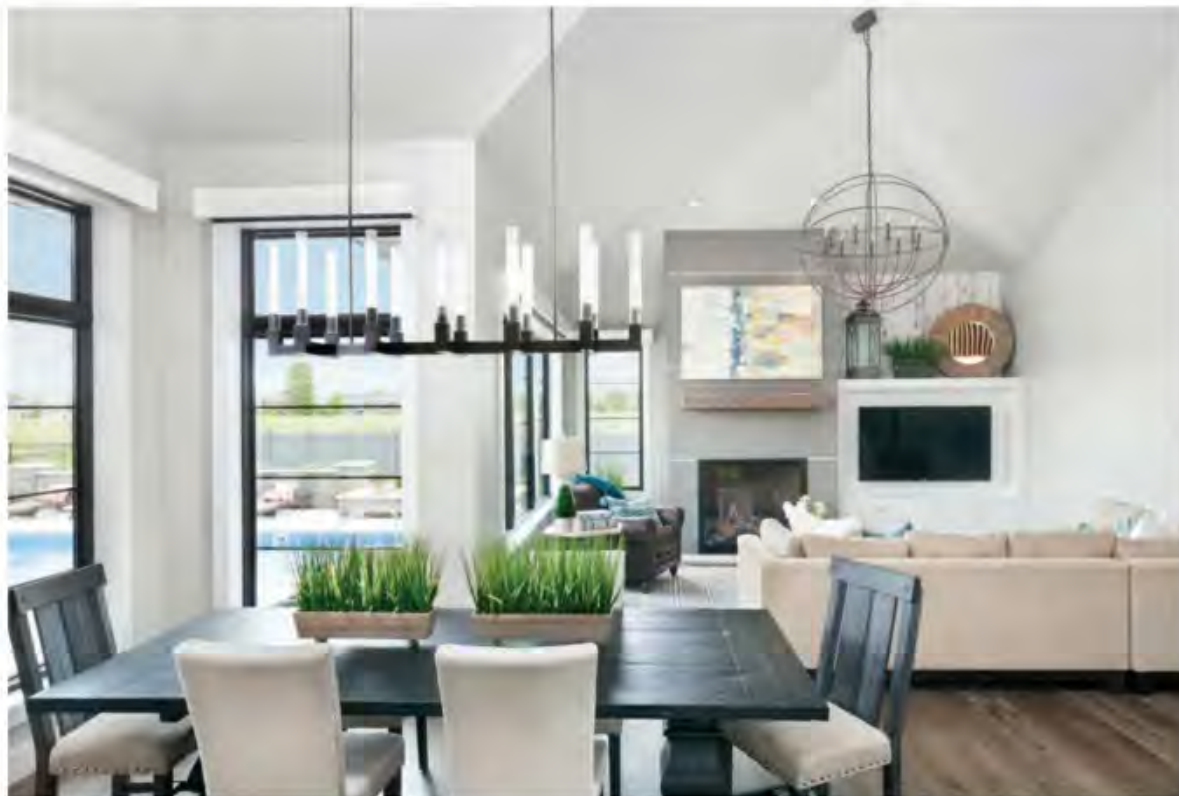
↑ The dining and living rooms enjoy expansive views of the pool area.

"The world can wear you down, and home should be a place where family comes together to recharge. I want people that leave our home to feel happy and refreshed."