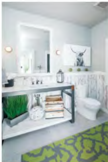
↑ A guest bath features weathered wall paneling/planking and a vanity with an industrial appearance.