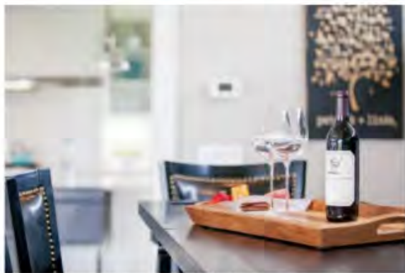
↑ The custom wood bar is a wonderful refreshment spot during a day spent near the pool.

↑ Overhead rustic beams, pendant lighting above a large kitchen island, white cabinetry and a gas range create a functional kitchen space with a modern, elegant appeal.