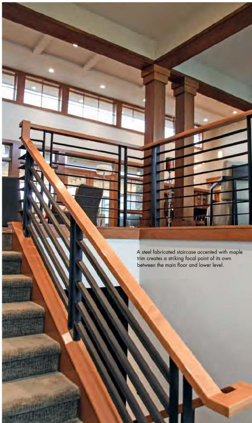
A steel fabricated staircase accented with maple trim creates a striking focal point of its own between the main floor and lower level.

“There were many moving parts and features associated with their home that all needed to integrate and function well.”