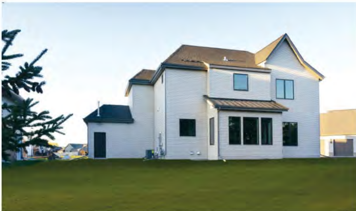
↑ The backside view of the home's exterior is equally eye-catching with interesting rooflines and wrap-around dining room windows.