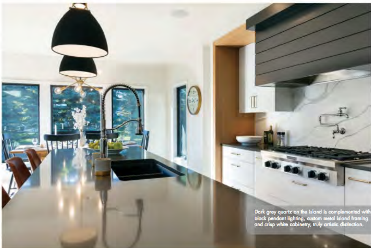
Dark grey quartz on the Island is complemented with black pendant lighting, custom metal Island framing and crisp white cabinetry, truly artistic distinction.

The kitchen utilizes black metal accents as evidenced in pendant lighting and custom steel island framing. Shiplap around the range hood and black stainless appliances are beautifully offset by a full-height, veined quartz backsplash, white oak soffit paneling, white cabinetry and brushed gold hardware. Near the kitchen is a handy nook area with a built-in desk. Variegated white oak floors throughout the home's main level add natural