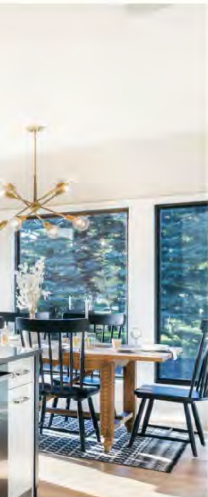
↓ Relaxing by the fire in the living room, homeowners will delight in wooded views and the easy flow into dining and kitchen spaces.

Built in 2017, the 4,250-square-foot home includes six bedrooms and five baths. Inviting, wooded views beyond the living and dining rooms welcome guests. A gas fireplace, topped with a reclaimed Douglas fir hearth and mantle against a custom veneer plaster wall finish, is an attractive focal point to the home's main living areas.