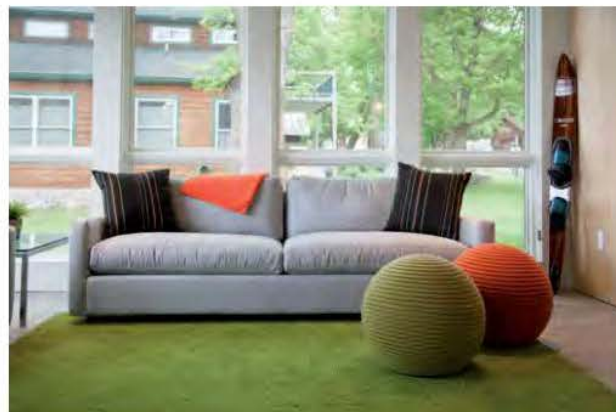
↑ A sofa is enhanced by a striped water ski, which coordinates with pillows and an orange throw. Massive windows welcome outdoor views inside.