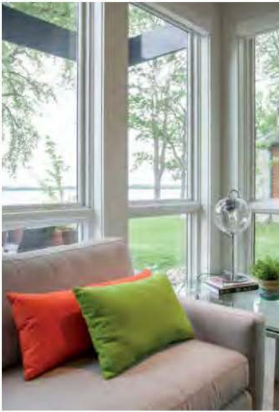
↑ Floor-to-ceiling windows provide lake views from any room or comfortable spot in the Flurers' home.