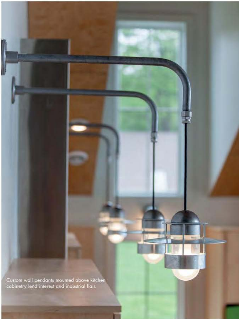
Custom wall pendants mounted above kitchen cabinetry lend interest and industrial flair.

galvanized metal roof complements the dark paint scheme, composite decking system, unique lakeside aluminum shade structure and colorful landscaping.”