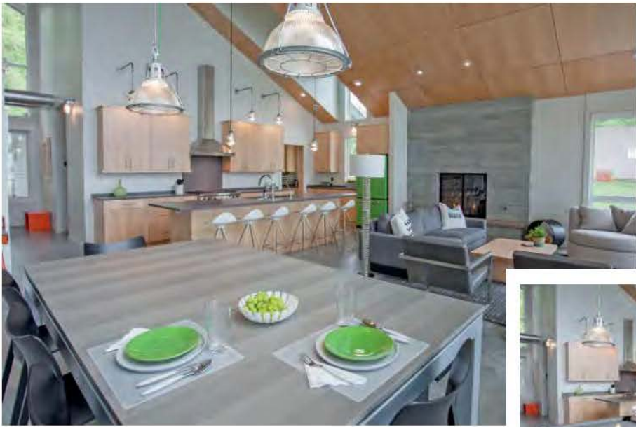
↑ Views from the second floor showcase gym lighting and an open layout with fabulous views of Pelican Lake.