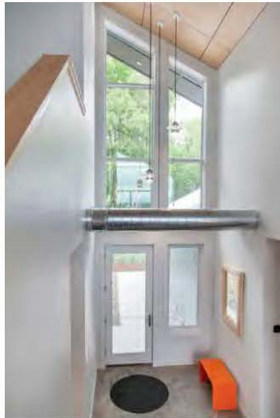
↑ The entryway invites abundant natural lighting. A convenient, cheery orange bench is positioned near a lime green entry door.

Tile accents and mirrored walls in the main floor master bathroom reflect color as well. A Duravit soaking tub and aquatic shower enclosure create a spa-like bath experience. The couple's master bedroom boasts a lovely woodland view.