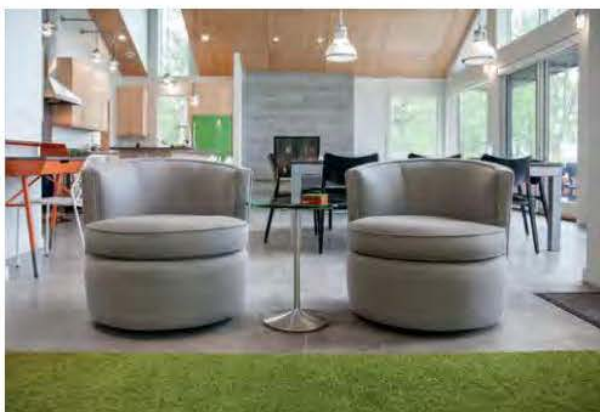
↑ Unique, neutral circle chairs in the sunroom are accented by a whimsical lime green shag rug. Overhead, industrial lighting and wall sconces create a lively, attention-catching space.

Robert and Robin salvaged a couple of the home’s light fixtures from a completed commercial electrical project. Fixtures have a galvanized finish with recycled gym lighting suspended over the dining table. “We purchased a dining room table that easily converts into a pool table,” Robert notes. “It’s a fun indoor activity for family, especially when the weather doesn’t cooperate.”