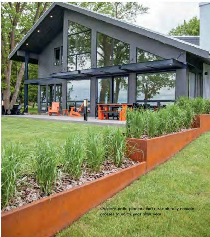
Outdoor patio planters that rust naturally contain grasses to enjoy year after year.