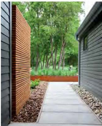
↑ The roadside entrance features a cedar wind screen and Corten planter.