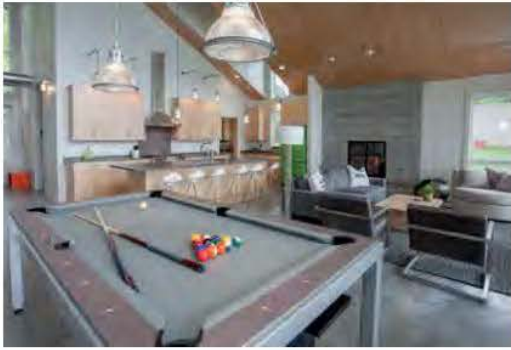
↑ → The couple purchased a modern dining room table, which easily converts into a pool table page 34.