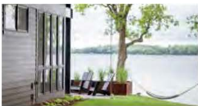
↑ A lakeside hammock and patio area beckons guests and family to relax and kick off their shoes